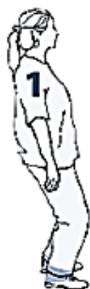
10-15 seconds (page 55)

Before you do any work in the garden, do a few minutes of easy stretching. This will help get your body ready to work efficiently without the usual tightness and stiffness that results from this kind of work. Stretch to reduce muscle tension and make work easier.