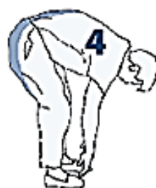
10-15 seconds (page 54)