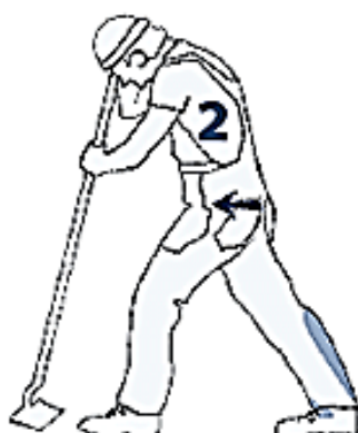
10-15 seconds each leg (page 71)