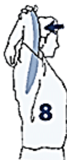
10 seconds each arm (page 44)