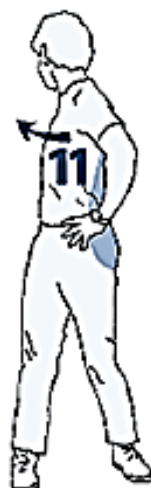
8-10 seconds each side (page 81)