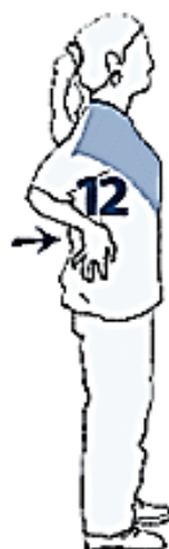
8-10 seconds 2 times (page 46)