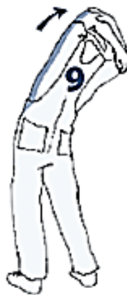
8-10 seconds each side (page 44)