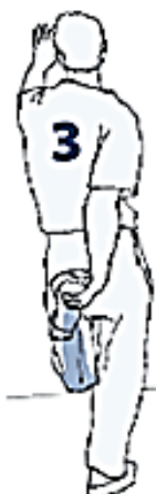
10 seconds each leg (page 75)