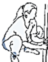
10 seconds (page 66)