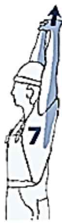
10-15 seconds (page 46)