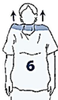
3-5 seconds 2 times (page 46)